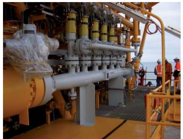
Topside 12" Class 2500 Multiple Pig Launcher for Kupe Gas Project