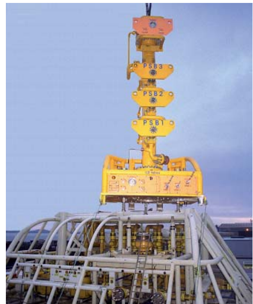
Subsea Multiple Pig Launcher for BP ETAP Project

A mechanical key interlock system can be integrated into this system to provide fail safe operation of the valves when pig reloading is required.